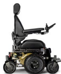
V6 ALL TERRAIN - BLACK RIMS