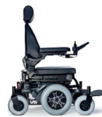
V6 HYBRID - GREY WHEELS

"WE'VE BEEN CREATING CUSTOM MADE VEHICLES FOR 22 YEARS, SO THAT YOU CAN LIVE THE LIFE YOU CHOOSE"