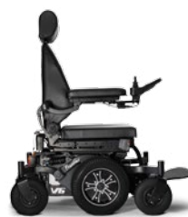
V6 HYBRID - BLACK WHEELS