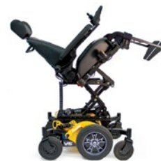
WITH LIFT AND TILT

"WE'VE BEEN CREATING CUSTOM MADE VEHICLES FOR 22 YEARS, SO THAT YOU CAN LIVE THE LIFE YOU CHOOSE"