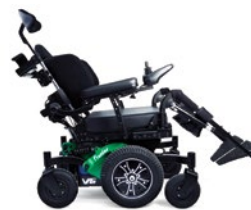
WITH POWER LEGS AND RECLINE