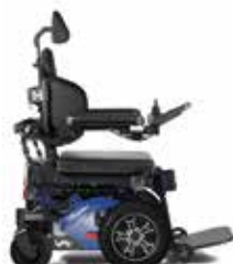
V4 FRONT WHEEL DRIVE - HYBRID BLACK WHEELS