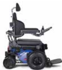
V4 FRONT WHEEL DRIVE - BLACK RIMS