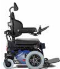
V4 FRONT WHEEL DRIVE - HYBRID GREY WHEELS