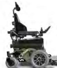
ARMY GREEN - GREY HYBRID WHEELS (PNEUMATIC OR SOLID)

"WE'VE BEEN CREATING MADE-TO-ORDER WHEELCHAIRS FOR OVER 25 YEARS, SO THAT YOU CAN LIVE THE LIFE YOU CHOOSE"