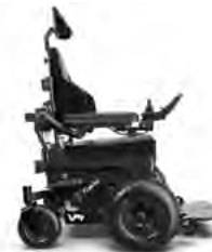
OYNX BLACK - BLACK AT WHEELS & RIMS