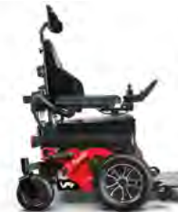
FLAME RED - BLACK HYBRID WHEELS (PNEUMATIC OR SOLID)