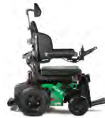
V4 REAR WHEEL DRIVE - BLACK RIMS