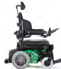
V4 REAR WHEEL DRIVE - HYBRID GREY WHEELS