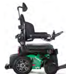
V4 REAR WHEEL DRIVE - HYBRID BLACK WHEELS