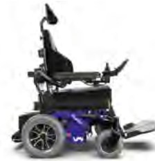
SPACE BLUE - GREY HYBRID WHEELS (PNEUMATIC OR SOLID)

"WE'VE BEEN CREATING MADE-TO-ORDER WHEELCHAIRS FOR OVER 25 YEARS, SO THAT YOU CAN LIVE THE LIFE YOU CHOOSE"