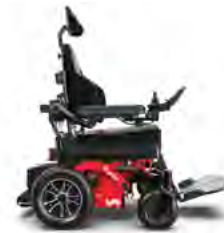
FLAME RED - BLACK HYBRID WHEELS (PNEUMATIC OR SOLID)