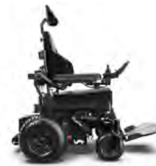
OYNX BLACK - BLACK AT WHEELS & RIMS