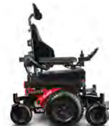
FLAME RED - BLACK AT WHEELS & RIMS