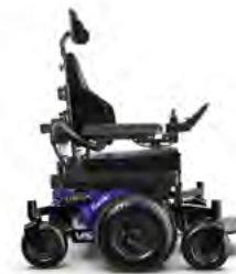
SPACE BLUE - BLACK AT WHEELS & RIMS