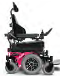
HOT PINK - GREY WHEELS (PNEUMATIC OR SOLID)