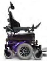
ULTRA VIOLET - GREY WHEELS (PNEUMATIC OR SOLID)