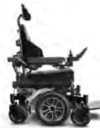
SILVER STREAK - BLACK WHEELS (PNEUMATIC OR SOLID)