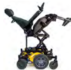
WITH LIFT AND TILT

"WE'VE BEEN CREATING CUSTOM MADE VEHICLES FOR 25 YEARS, SO THAT YOU CAN LIVE THE LIFE YOU CHOOSE"