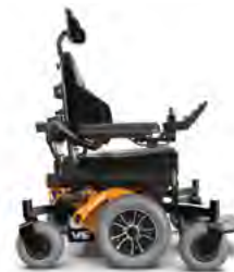
BURNT ORANGE - GREY HYBRID WHEELS (PNEUMATIC OR SOLID)