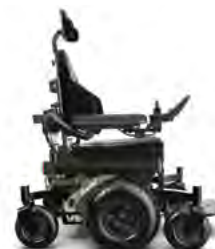
ARMY GREEN - BLACK AT WHEELS & RIMS