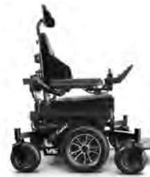
OYNX BLACK - BLACK HYBRID WHEELS (PNEUMATIC OR SOLID)