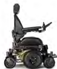
V6 ALL TERRAIN - OFF-ROAD WHEELS BLACK RIMS