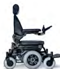
V6 HYBRID - GREY WHEELS