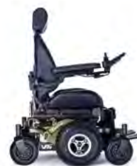
V6 ALL TERRAIN - OFF-ROAD WHEELS SILVER RIMS