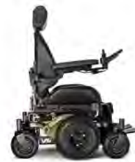
V6 ALL TERRAIN - OFF-ROAD WHEELS